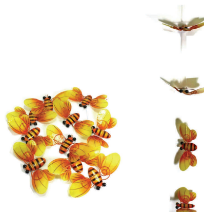
Garland Bees QN00278 Approx 50" long