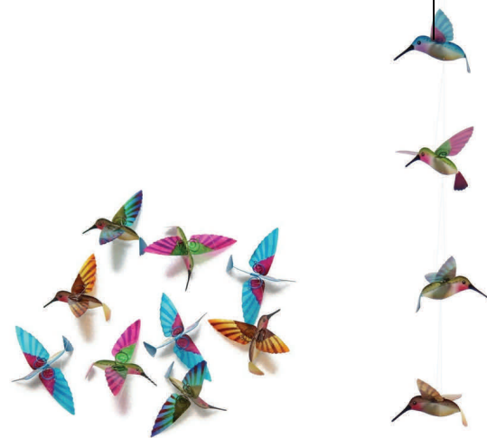
Garland Capiz Hummingbird Multi-Colored QN00281 Approx 60" long

Made with a hand-painted metal frame and Capiz wings. Each garland is assembled by hand into a flock of 10.