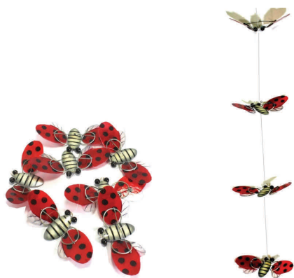
Garland LadyBug QN00277 Approx 56" long