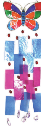
Windchime Butterfly QN00274 Approx. 15" long