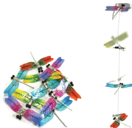
Garland Capiz Dragonfly Multi-Colored QN00279 Approx 50" long