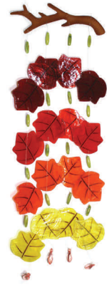
Windchime Maple Leaves QN00275 Approx. 17" long