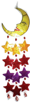
Windchime Moon and Stars QN00272 Approx. 18" long