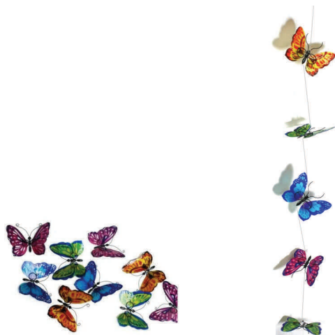
Garland Shell Butterfly Multi-Colored QN00273 Approx 55" long