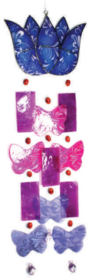
Windchime Blue Lotus QN00271 Approx. 16" long